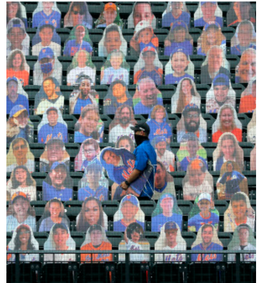
A Masked Mets Employee Prepares for the "New Normal" in Sports Spectating

The return of live sports has been great to witness. Even though