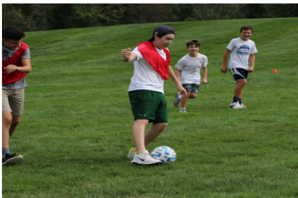
Four 8th Graders Enjoying some Footie after School

As fall sports wrap up, we, the Delbarton Community, are proud to announce the success of our intramurals. The sports offered were flag football, ultimate frisbee, soccer, and a grueling 3k race. According to many students, intramurals were "Very fun, a great chance to get to know all your friends and students better, and it allows the students to do activities after school when they have nothing else to