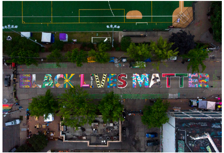
BLM is now forever etched into the pavement of Seattle, WA

BLM and other forms of activism are opportunities to speak up against injustice, social media, and messages to the government are critical roles in calling for change and transformation in society. "All lives matter" is the argument against BLM. While I agree that every person is important and should be treated with dignity and respect, the only difference is that currently people of color are trying