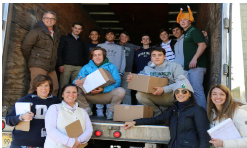
Students, Faculty, and Family Volunteers Pose after Successful 2019 Drive