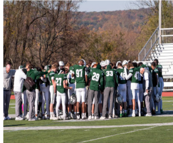
The 6-0 Green Wave squad finished first in the Super Football Conference.