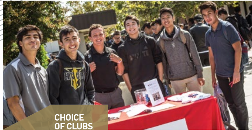
CHOICE OF CLUBS