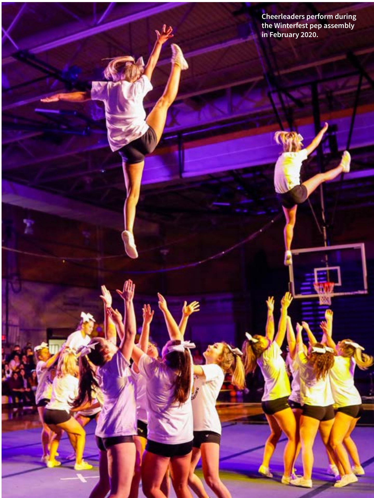
Cheerleaders perform during the Winterfest pep assembly in February 2020.