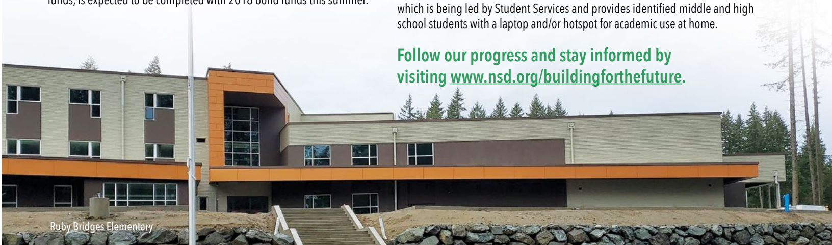
Ruby Bridges Elementary

Follow our progress and stay informed by visiting www.nsd.org/buildingforthefuture .