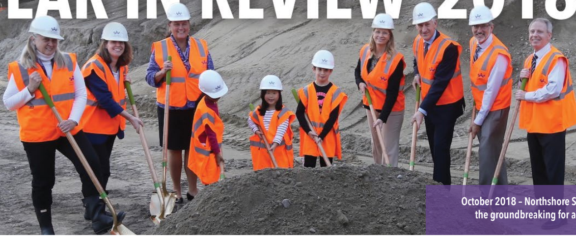
October 2018 - Northshore School District celebrated the groundbreaking for a new elementary school.