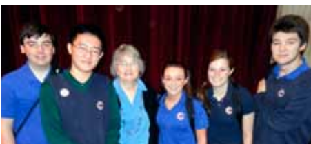
Katherine Paterson, Newbery Medal winning author, visits CCHS. "Authors in the Classroom" program.