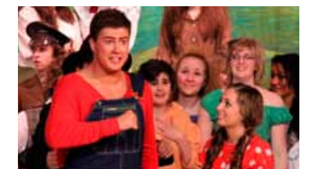
"L'il Abner", April 2012

CCHS Theatre Guild Fall Production, 7:00 PM