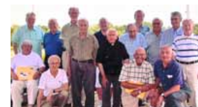
CCHS Class of 1948 July Lunch Bunch