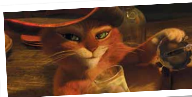
▲ The legendary hero, Puss in Boots.

Forever After and "Puss" in Puss In Boots . Both Kung Fu Panda 2 and Puss In Boots were honored with Oscar nominations for best animated feature films. His newest creative endeavor