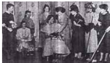
Newspaper photo of St. Mary Class of 1956 play