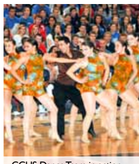
CCHS Dance Team in action, readying for their Jan. 2012 Orange Bowl performance