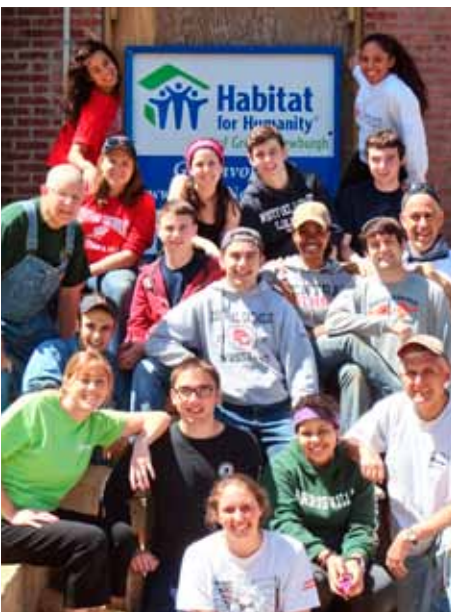
Project Rebuild celebrates 20th year as students work at Habitat For Humanity, Newburgh, NY