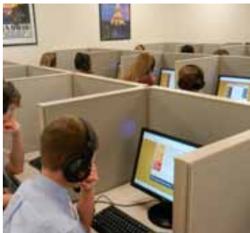
Students take advantage of the new state-of-the-art digital language learning lab