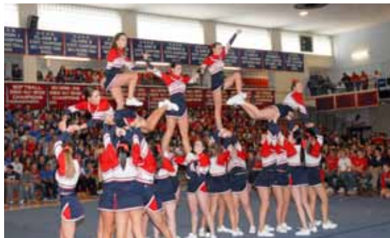
Raider Cheerleaders qualified for the MA State Championships