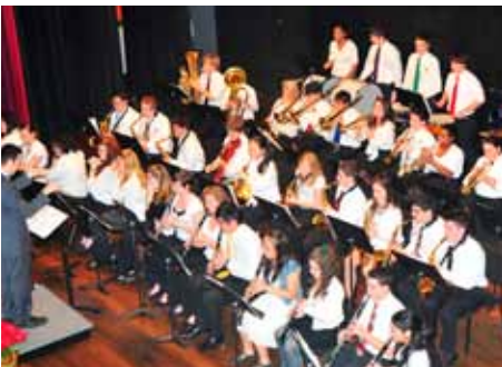
Talented musicians of CCHS Concert Band perform at Christmas Concert