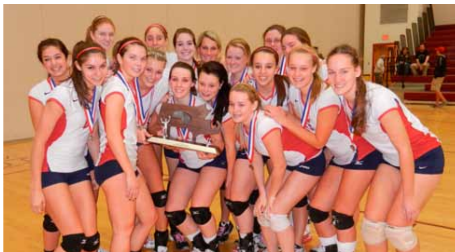
Lady Raiders are MVC Volleyball Champs & Div. I MA State Finalists