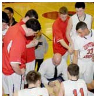
MVC Basketball Champs plan a big win