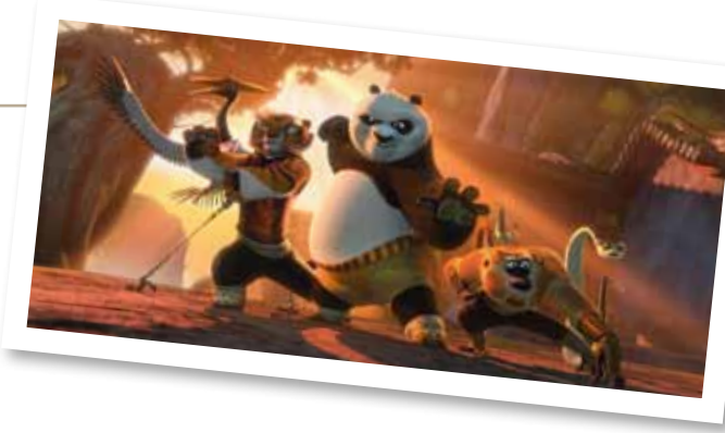
▲ Po, The Kung Fu Panda & The Furious Five

is the animation of "Jack Frost", the lead character in the DreamWorks feature, Rise of the Guardians set to be released in November 2012. To see the official movie trailer for "Rise of the Guardians", go to http://youtu.be/aPLiBxhoug0 .