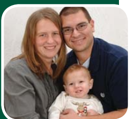
Puma/ Blanco baby