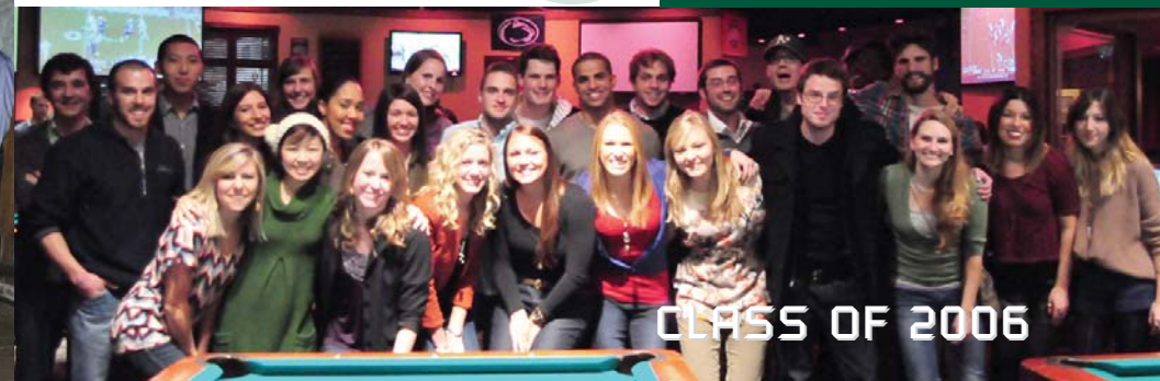
CLASS OF 2006

The Class of 2006 celebrated their five-year reunion on November 26, 2011 at the Fox and Hound in King of Prussia. 29 members of the Class of '06 were in attendance, with a total of 35 guests. People came from as far as Texas and Arizona, and a great time was enjoyed by all as everyone caught up on the events of the last five years and reminisced on old memories. We look forward to our 10-year reunion in 2016.