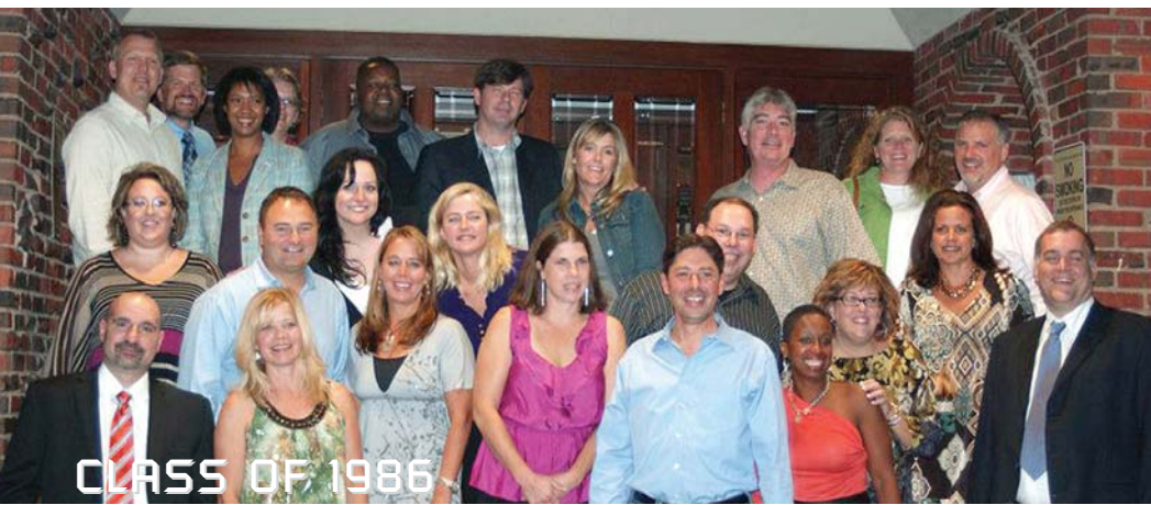
CLASS OF 1986