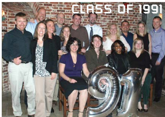
CLASS OF 1991