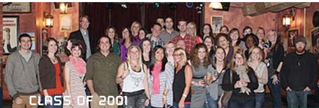
CLASS OF 2001