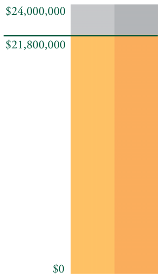
CAMPAIGN COMMITMENTS AS OF DECEMBER 2011

“Trust in the Lord with all your heart and lean not on your own understanding; in all your ways acknowledge him, and he will make your paths straight” Proverbs 3:4-5