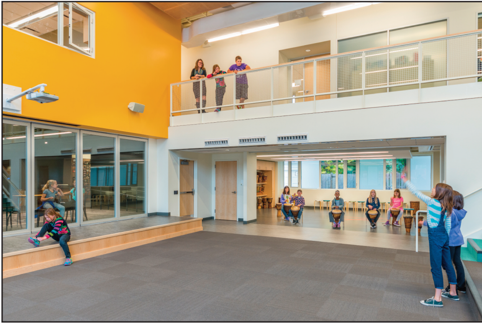
The acoustic walls of the Music & Movement Studio (above) are foldable, allowing the room to open up to the Hub; the new gymnasium (below) is twice as large as the previous one and has allowed the school to increase the number of sports available to the students.